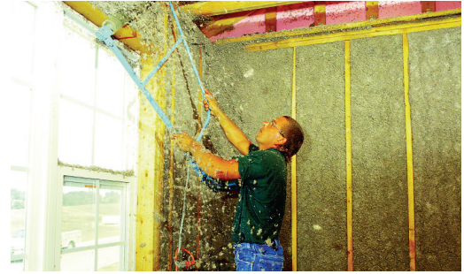
An installer “shaves” excess wet-spray cellulose fiber insulation from wall studs after it has dried.

The measures that qualify a home for ENERGY STAR make it more energy efficient than a standard home. Effective insulation, duct sealing, more efficient heating and cooling equipment, and independent testing to verify performance can result in homes using substantially less energy. Additional savings on maintenance costs also can be substantial.